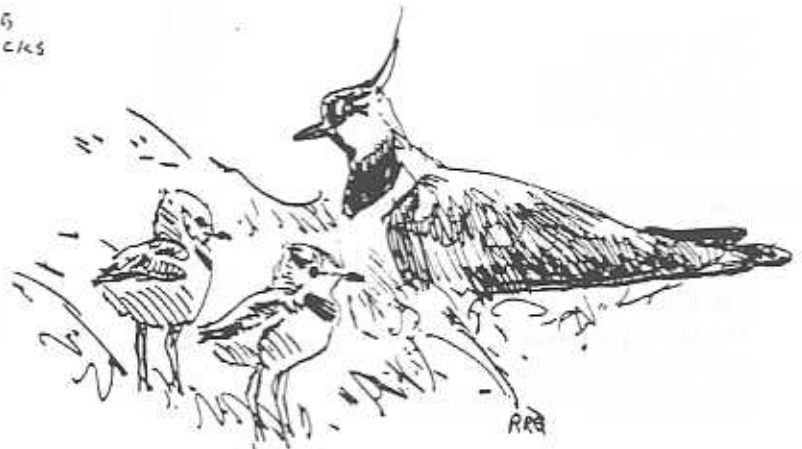
LAPWING WITH CHICKS