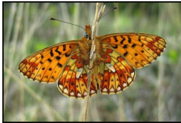
The Pearl-bordered Fritillary was once common in Southeast woodlands. Its population and range is declining rapidly.

Woodland butterflies and moths are among the most threatened groups of insects in the UK, and their decline has often been fastest in the South East. After hundreds of years of woodland management many woods are now being neglected or under-managed. To tackle this, Butterfly Conservation is launching its biggest conservation project so far.