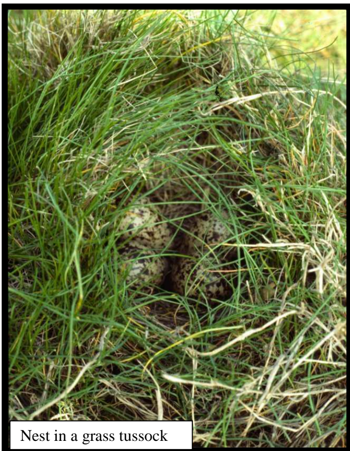
Nest in a grass tussock