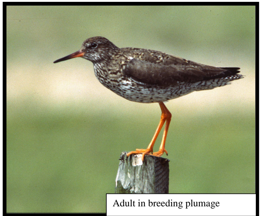
Adult in breeding plumage

Nature Reserve throughout the winter. The peak counts relate mainly to birds in the high tide roost: 340 on 15 January 1985, 225 on 27 December 1999 and 220 in August 1978.