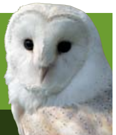
OWL PHOTO: DARIN SMITH / SUSSEX WILDLIFE TRUST

Info : www.RXwildlife.org.uk / 01797 227784