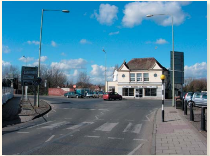
Kettle of Fish Roundabout