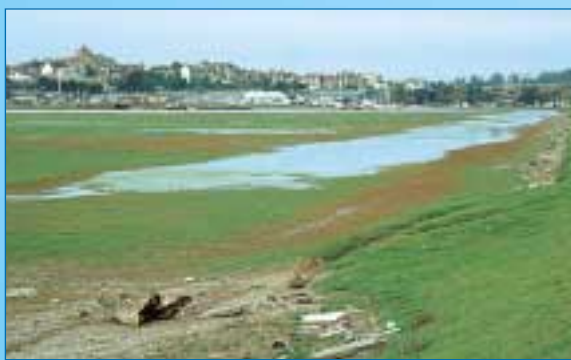
Grazed saltmarsh near Rye

In Rye Bay, saltmarsh is found along the tidal channels of the rivers Rother, Brede and Tillingham. In some sections it is restricted to a small fringe of vegetation. Historically much of the Romney Marshes was saltmarsh before being drained for agricultural land. Saltmarsh is now declining because of rising sea levels. Fortunately, it can be re-created and this has been carried out at Rye Harbour Nature Reserve.