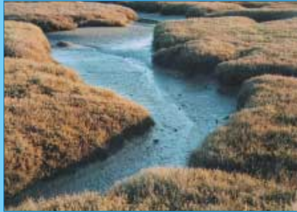
Saltmarsh at Rye Harbour